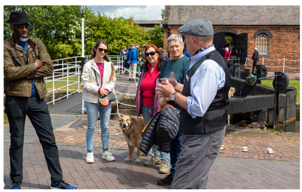
'Canal Town' costumed tour guides