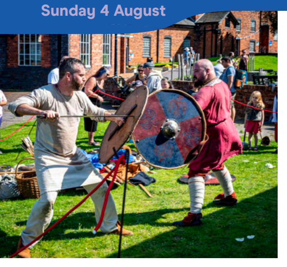
The Unknown Vikings

Come and see how your ancestors lived and immerse yourself in the Viking Age! Take part in interactive activities throughout the day as costumed performers entertain visitors with Viking battles and displays.