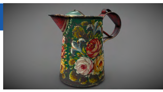
Our photogrammetry suite is kindly supported by players of People's Postcode Lotteru

See how our new photogrammetry suite is being used to record the distinctive 'roses and castles' canal art as well as viewing examples of fantastic canal scenes. Bring your sketch pad and join local artists who will be drawing and painting on site.